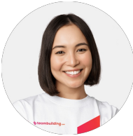
Client Advisor Your client advisor can help with customizations, large groups and multi-event packages.

We build and run world class team building experiences, with 1,000,000+ participants and 45,000+ clients to date. You can choose from 50+ experiences, both in-person and virtual that are designed to maximize participation, engagement, teamwork and happiness. Every experience is led by an expert teambuilding.com host with substantial training to make sure your experience exceeds expectations.