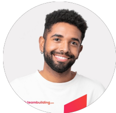
VIP Support VIP Support is your point of contact before the experience and handles any follow up tasks.