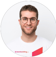
Co-Host A co-host manages the technical aspects and "behind the scenes" work so that it all runs smoothly.