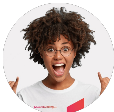
Lead Host This experience is led by an expert teambuilding.com host that makes sure everyone participates and has a great time.