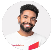
VIP Support VIP Support is your point of contact before the experience and handles any follow up tasks.