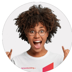
Lead Host This experience is led by an expert teambuilding.com host that makes sure everyone participates and has a great time.