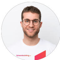
Co-Host A co-host manages the technical aspects and "behind the scenes" work so that it all runs smoothly.