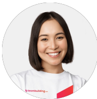
Client Advisor Your client advisor can help with customizations, large groups and multi-event packages.

We build and run world class team building experiences, with 1,000,000+ participants and 45,000+ clients to date. You can choose from 50+ experiences, both in-person and virtual that are designed to maximize participation, engagement, teamwork and happiness. Every experience is led by an expert teambuilding.com host with substantial training to make sure your experience exceeds expectations.